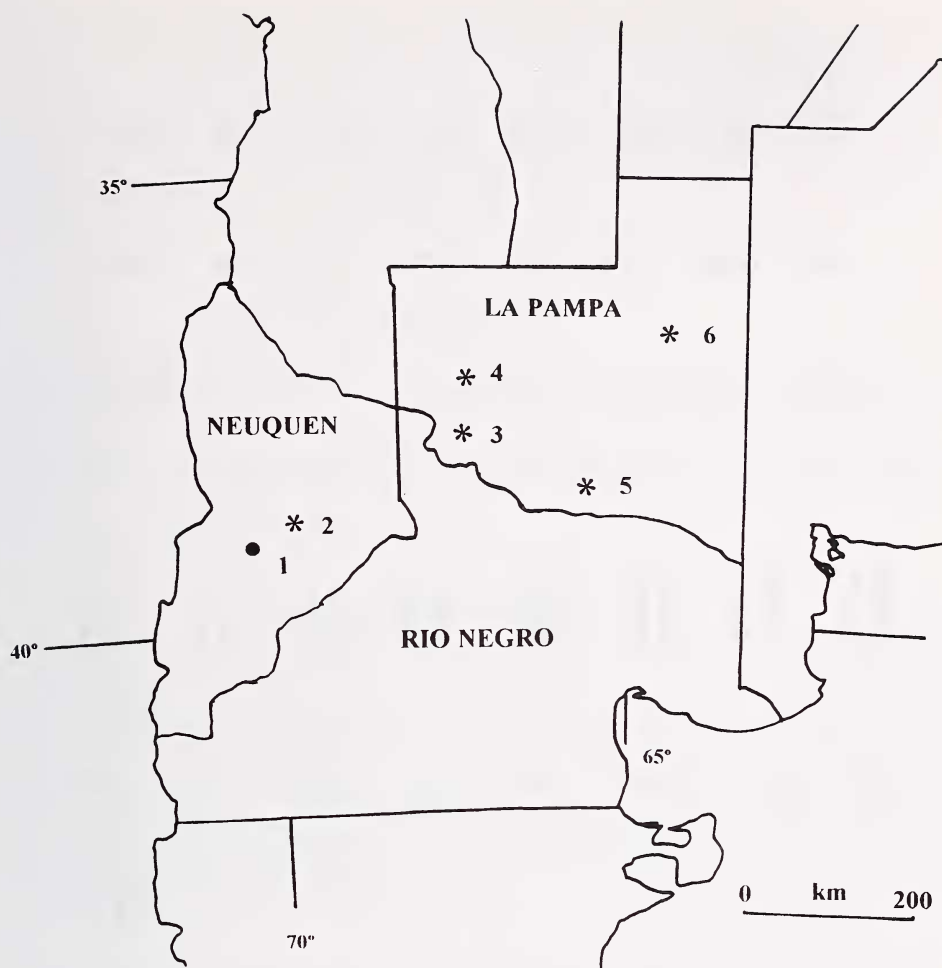
Fig. 1. Neuquén and La Pampa provinces, central Argentina with collecting localities: 1. Laguna Blanca National Park. 2. 20 km E Zapala. 3. 25 km SE Puelén. 4. Cerro Colón. 5. Puesto Las Lagunitas. 6. Estancia Los Toros. Asterisks denote the 2n = 44 karyotype and the solid circle the 2n = 34 .

Previously, ORIELLS et al. (1989) had described 2n = 32 – 33 karyotypes for specimens of Eligmodontia sp. The 2n = 32 karyotype consisted of 14 pairs of acrocentric autosomes and a pair of small metacentrics. A polymorphism involving an heteromorphic pair composed of one small metacentric and two small acrocentrics produced the 2n = 33 variant. For both karyotypes the X was telocentric and Y metacentric. Later, KELT et al. (1991) described further 2n = 32 karyotypes from other Patagonian localities and gave reasons for the assignment of these forms to E. morgani . Furthermore, the 32, 33 and 34 variants were demonstrated, though G-banding and meiotic studies to “belong to one polymorphic system involving a Robertsonian fusion” (ZAMBELLI et al. 1992).